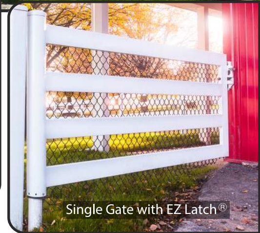
Single Gate with EZ Latch®