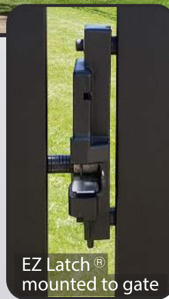
EZ Latch® mounted to gate