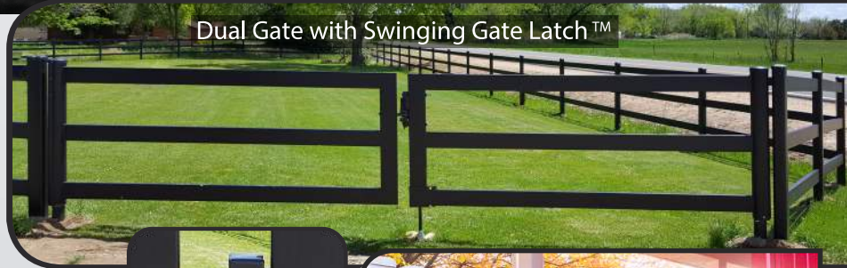
Dual Gate with Swinging Gate Latch™

Latch with EZ Latch® for fast access, ground anchors, or a combination for the best of both.